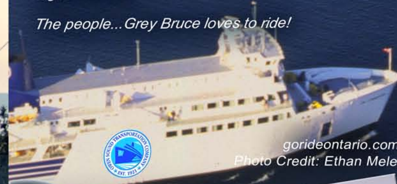
gorideontario.com Photo Credit: Ethan Meleg